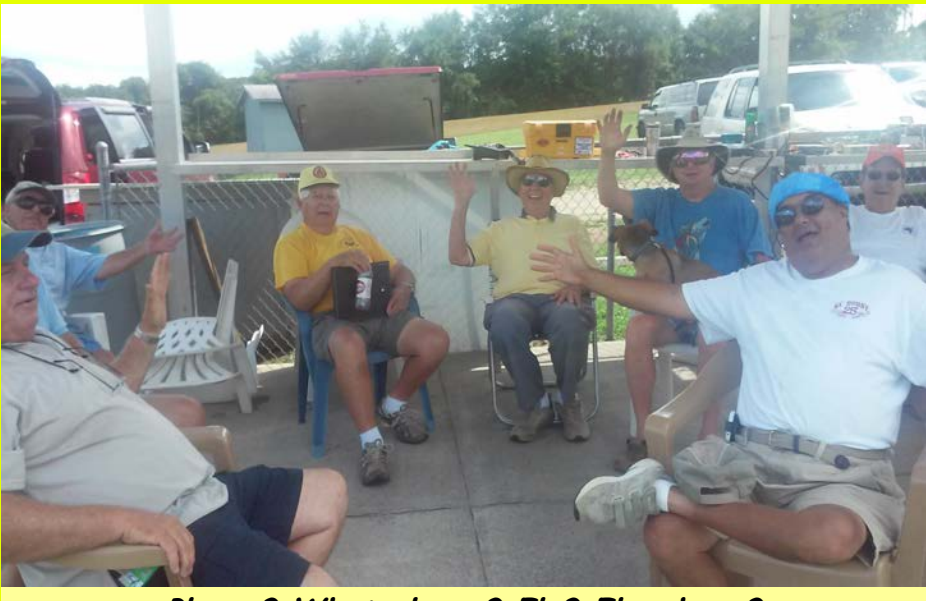
Planes? What planes? Fly? Fly where?