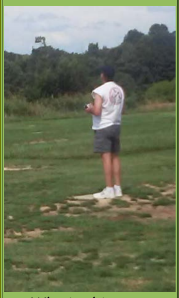
Who is this man?