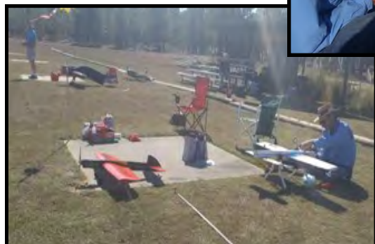
The new Twister wing. Almost ready to fly

I have enjoyed flying it countless times in the past two years. But last Sunday it started acting a little funny. An odd bump flying level, and then uncharacteristically started hunting. And when I pulled on the down line to pull out of a square, nothing happened. It met its final match with the turf. Thanks, Watt for the time I had with it. It's all over now.