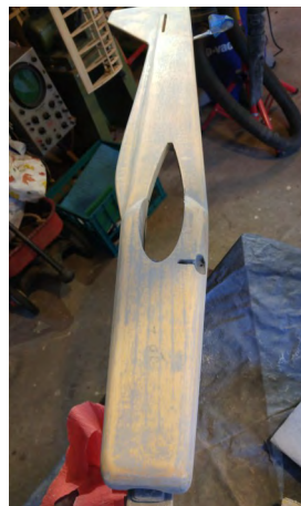
My Twister under construction