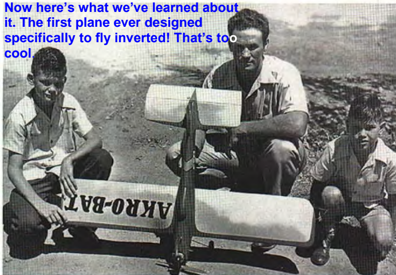
The great Bill Skipper introduced the Akro-Bat in 1947. It was guaranteed to fly inverted, and it was the first such kit on the market. Just look at what Bill started!

Now here's what we've learned about it. The first plane ever designed specifically to fly inverted! That's too cool!